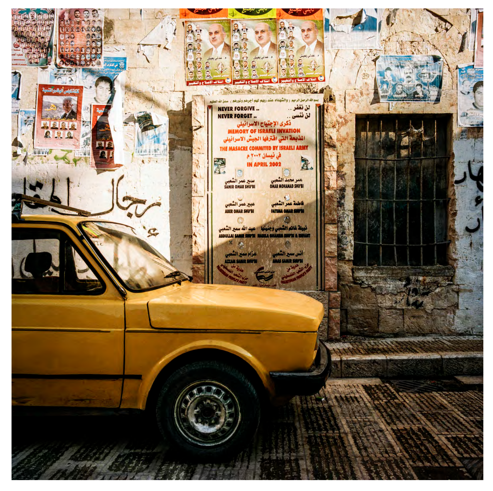
In the name of Allah, the Gracious, the Merciful (and those who are righteous martyrs with their Lord, they shall have their reward and their light) Surat Al-Hadīd (The Iron) Verse 19 God Almighty has spoken the truth

We will not forgive. We will not forget. In memory of the Israeli invasion. The massacre committed by the Israeli Army in April 2002.