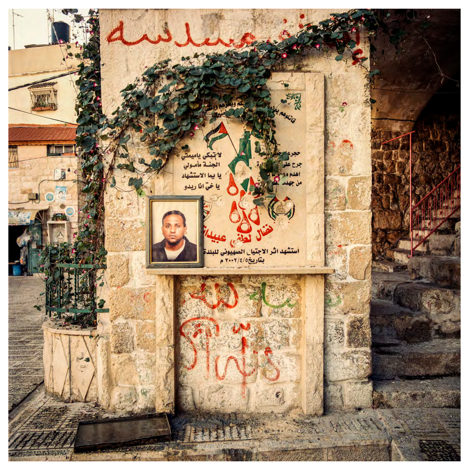
Fight them that Allah may punish them at your hands and disgrace them, and give you victory over them and heal the hearts of a people who believe.

Surat At-Tawbah (The Repentance) Verse 14