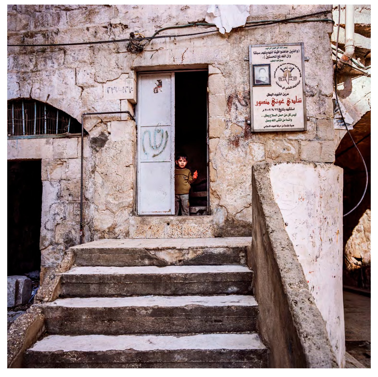
In the name of Allah, the Gracious, the Merciful And those who strive for Us – We will surely guide them to Our ways. And indeed, Allah is with the doers of good.

Surat Al-`Ankabut Verse 69 God Almighty has spoken the truth