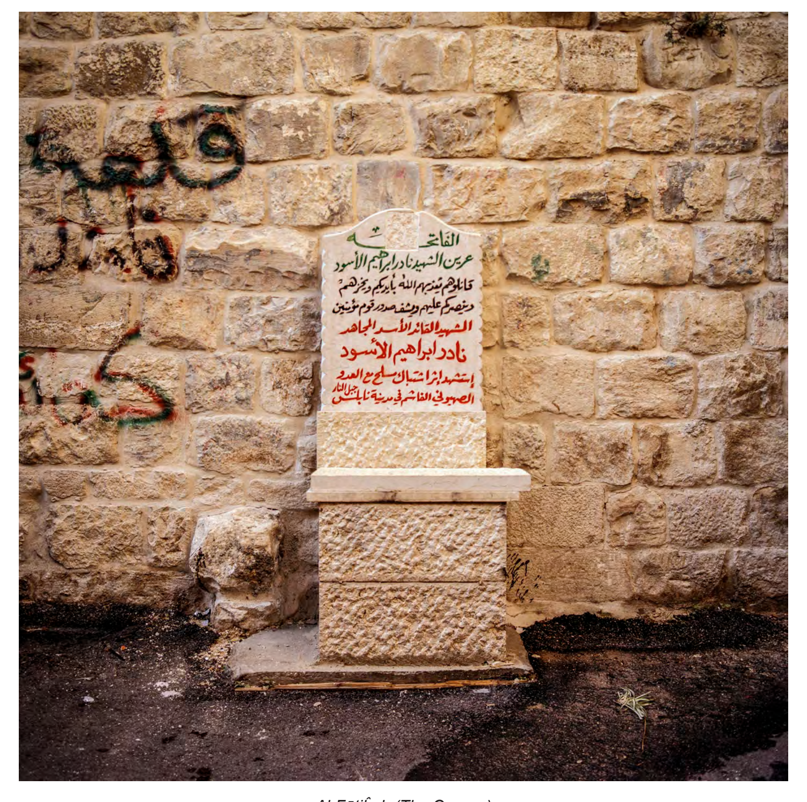
Al-Fātiĥah (The Opener)

(calling on the beholder to recite Al-Fātiĥah, the first Surah of the Quran, which is supposed to be the opening to all prayers)