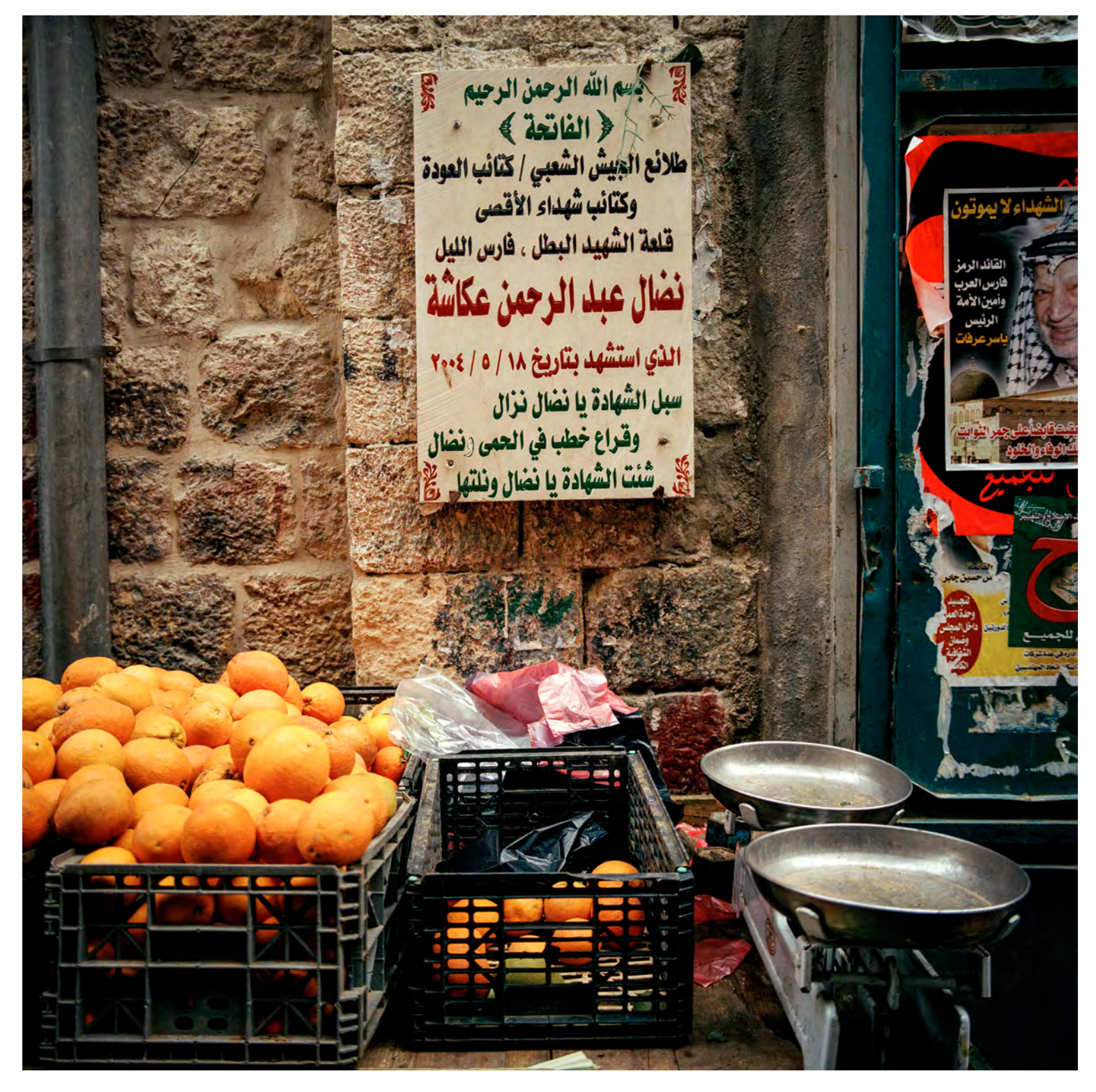
In the name of Allah, the Gracious, the Merciful Al-Fātiĥah

The Vanguard of the Popular Army – Al Awda Brigade – Al Aqsa Martyrs Brigades