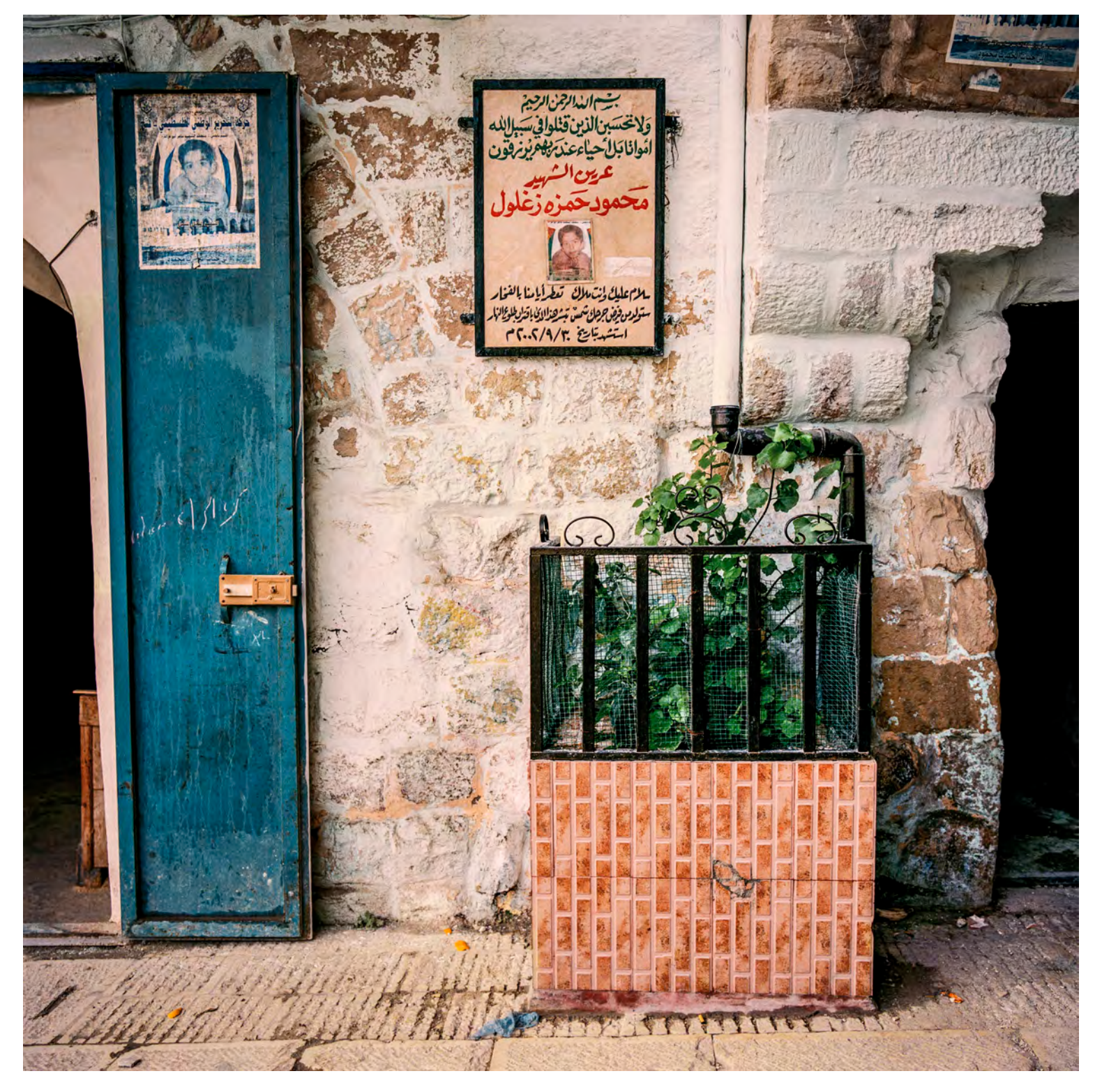
And never think of those who have been killed in the cause of Allah as dead. Rather, they are alive with their Lord.

Surat Āli Imrān (Family of Imran) Verse 169