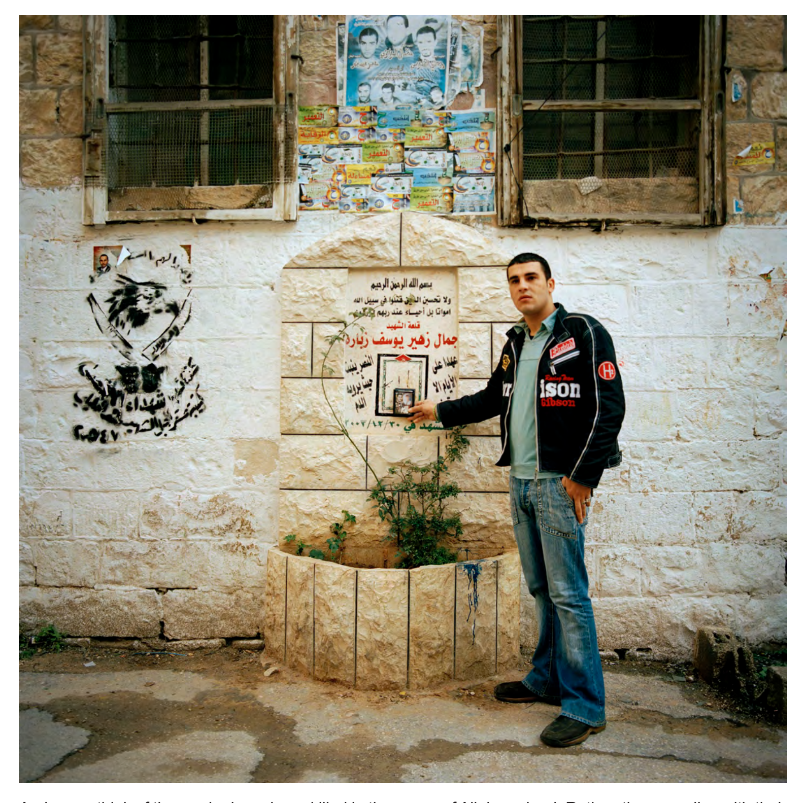
And never think of those who have been killed in the cause of Allah as dead. Rather, they are alive with their Lord.

Surat Āli Imrān (Family of Imran) Verse 169